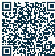
CHI NL Slack