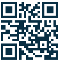
CHI NL Website